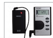
Attach to electronic metronome or smartphone