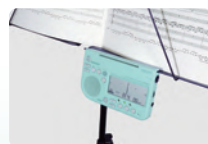
Slit convenient to attach to music stand