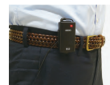
Can be attached with a clip