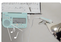
Reference tone like a Clarinet sound